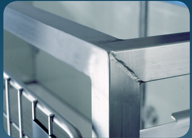
Fully welded and brushed steel construction