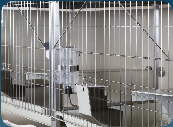
Large connected surface