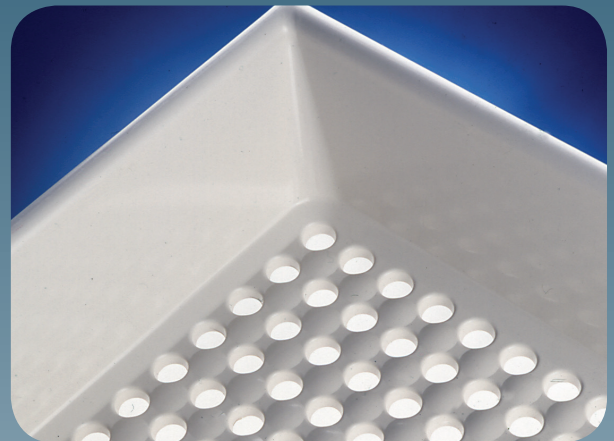
Floor is easy to clean