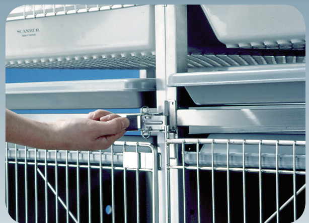
Easy connection of racks