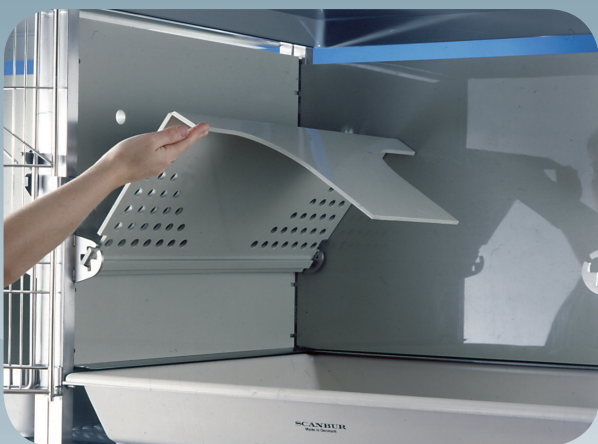
Combined shelter/resting shelf